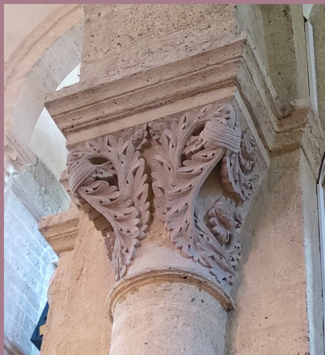
CC-by-sa CC Saulieu Morvan